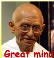
Great minds think alike

"All good thoughts and ideas mean nothing without action"