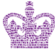
The Queen's Award for Voluntary Service

The Queen's Award is your opportunity. The Award recognises service from these groups, what is called "The MBE for Volunteer Groups". Our own Handicapped Children's Fellowship won it a few years ago, and it really was great recognition—and fun.